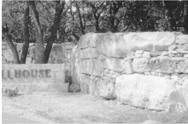
Figure 10-24 Dry-stack wall with large and small stones.