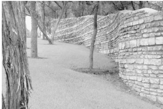
Figure 10-25 Mortared stone walls.

single-story retail and warehouse construction over lightweight steel structural frames. Both hollow concrete block and hollow brick are used, depending on the aesthetic requirements of the project, but CMU is much more common. Lateral support connections at the roof line must be flexible to permit deflection of the structural frame independent of the masonry, as well as differential thermal and moisture movement between the various materials (see Fig. 10-31).