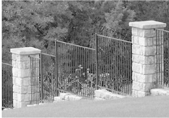
Figure 10-22 Allow for expansion and contraction of metal between masonry piers.